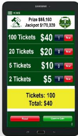
1) Select Price-Point