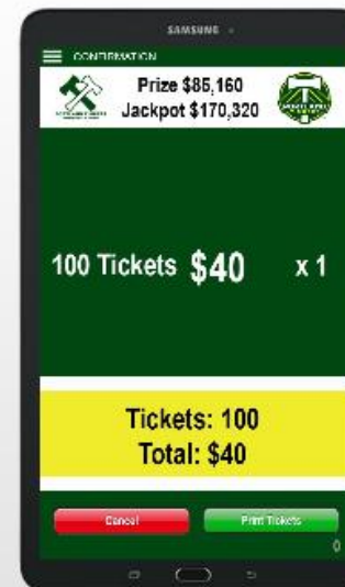
4) Confirm & Print Tix