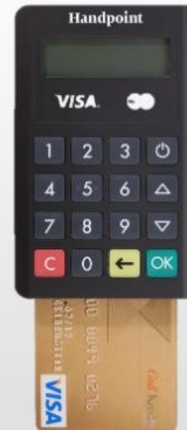
Credit Card device