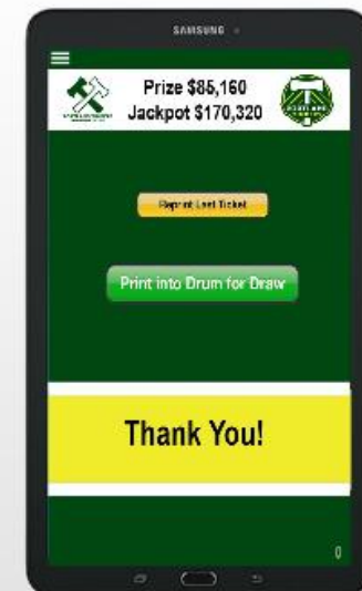
5) Enter Into Drum