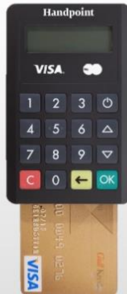
3) Insert Credit Card